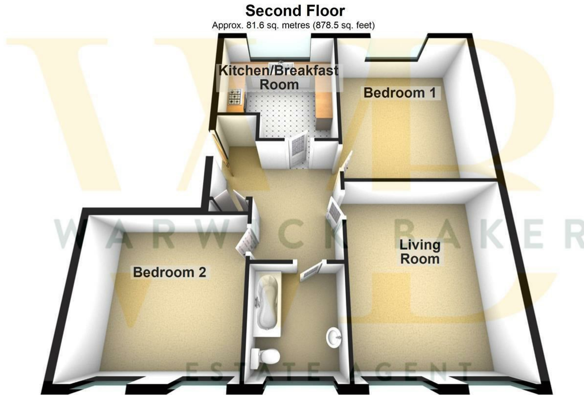
Total area: approx. 81.6 sq. metres (878.5 sq. feet)